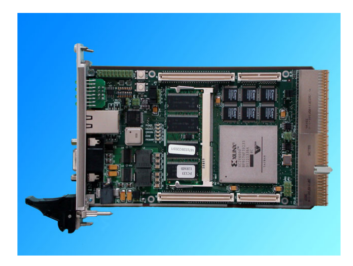
Figure 4: The GR-CPCI-XC2V board used for the prototype Raksha system.

values are generated by a simple functional-only model of Raksha for SPARC. If the validation fails, the test case halts with an error. The test case generator supports almost all SPARC V8 instructions. We have run tens of thousands of test cases on the simulated RTL using a 30-processor cluster and on the actual FPGA prototype.